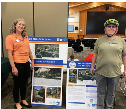
Eel River Trail Project and Rio Dell Gateway Beautification Project, City of Rio Dell, Cycle 1 Awardee