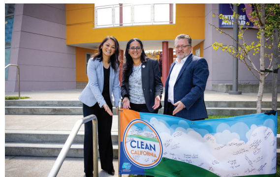
South of Market (SoMa) Transit Gardens Connection Project, San Francisco Municipal Transportation Agency, Cycle 1 Awardee