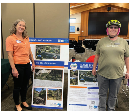
Eel River Trail Project and Rio Dell Gateway Beautification Project, City of Rio Dell, Cycle 1 Awardee